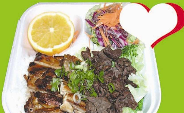
the works plate